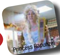
Spinach with Tomato and Red Pesto

Cucumber with Cream Cheese and Dried Mint