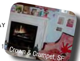
Crown & Crumpet, SF